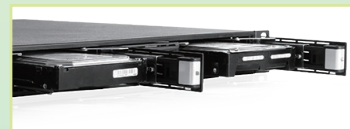
Hotswappable 3.5" HDD Drive Bays