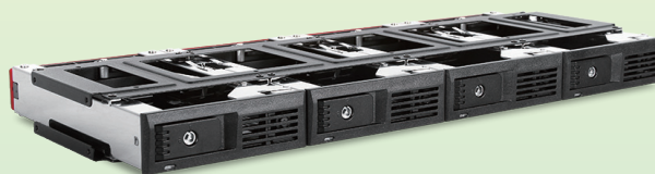
AN-CS1403 Removable 4 x 3.5" HDD Module